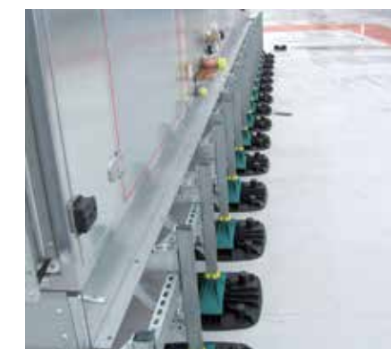
Lancashire – UK / Property Refurbishment