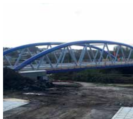
Bristol – UK / Bridge Construction