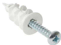
WRX PP 14x32