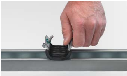
1 Place and turn into strut