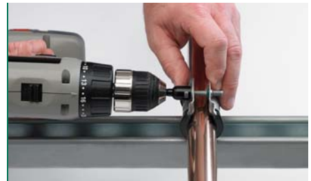
3 Tighten screw