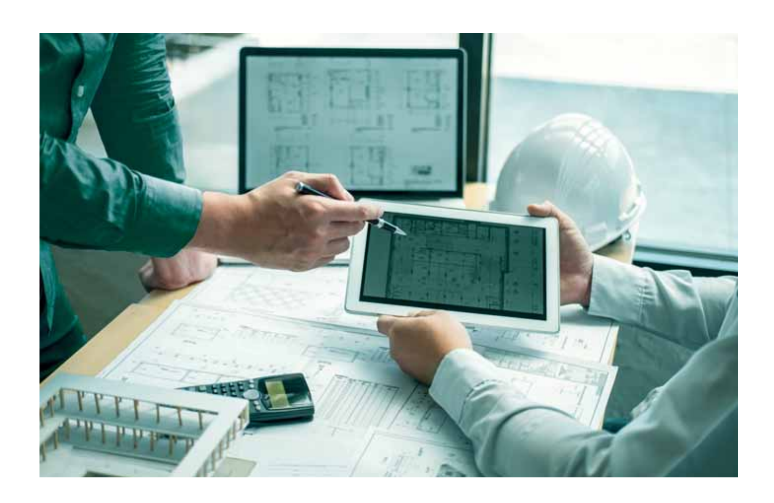
Pre-and onsite project support