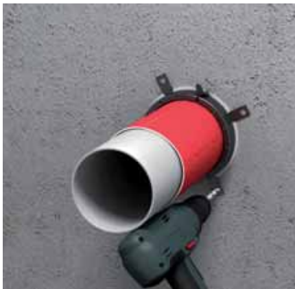
4. Drill (bending and sliding of fixing tabs is permitted)