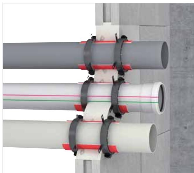
Aperture with optional noise insulation

Note: Walraven recommends to mark each individual penetration with a Pacifyre® AWM III Fire Collar by means of a Pacifyre® ID-Card.