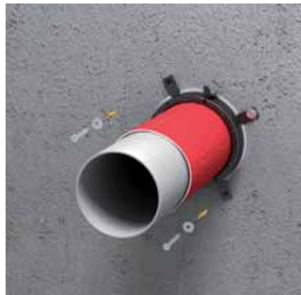
5. Fix using the screws supplied