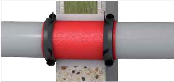
Built-in situation solid and light partition walls \geq 100 mm