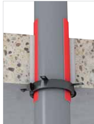
Combustible pipes up to 200 mm outer diameter