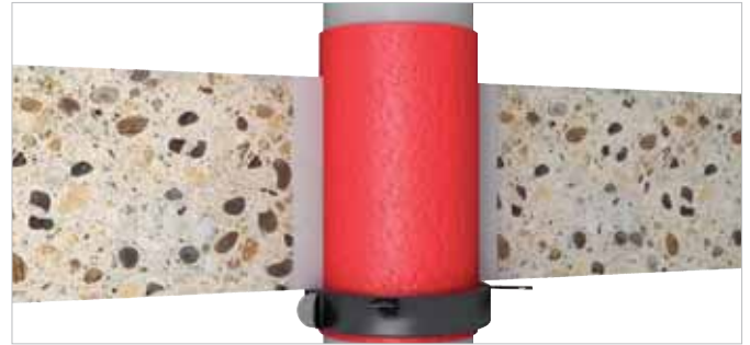
Built-in situation ceilings \geq 150 mm