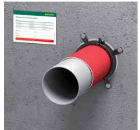
6. Apply the Pacifyre® ID-Card

Note: the built-in guidelines of the general building regulations must be adhered to.