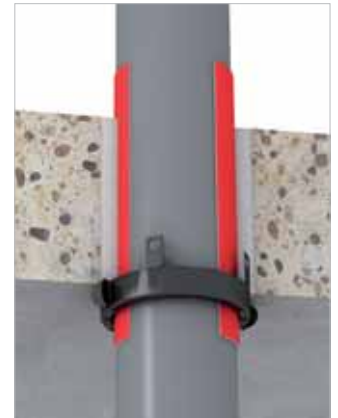
Fixing tabs mortared (90° reversed)