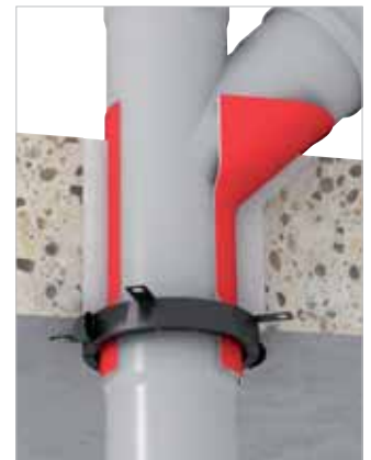
T-joint close to penetration