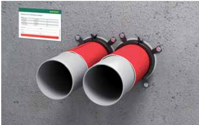
Zero distance possible between the collars