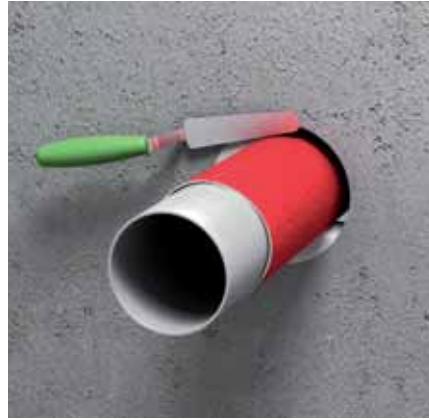
2. Ensure smoke tight seal of the annular hole (e.g. with Pacifyre® FPM Fire Protection Mortar or Tangit FP 430 Fire Protection Acrylic Sealant)