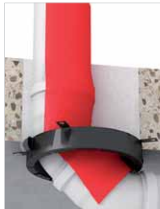
Bends directly under the ceiling