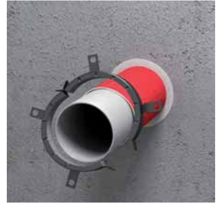
3. Select the correct collar size (in problematic built-in situations the use of an oversized collar is permitted up to max. 3 sizes bigger)