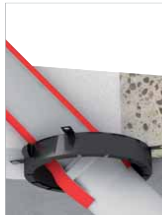
Also suitable for diagonal penetrations