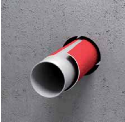
1. Install pipe and if necessary apply noise insulation