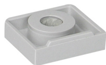
085 4 XXX

accessories BIS starQuick® Pipe Clamps without Nut