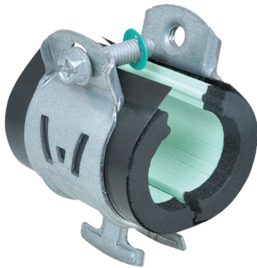
206 1 XXX

to be used with pipes that need to be insulated 6 - 43 mm