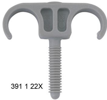
391 1 22X