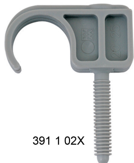
391 1 02X