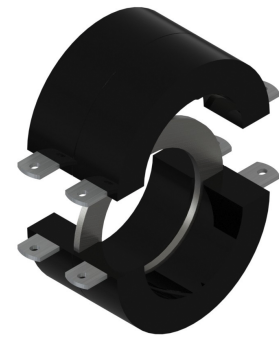
088 1 XXX BISOFIX® CF