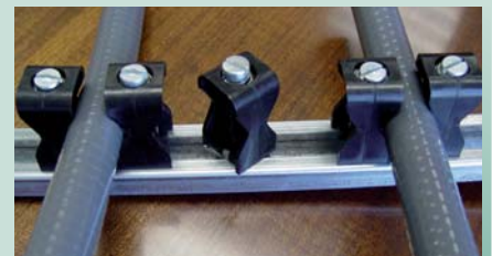
Easy fixing on rail