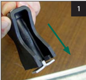
Press at the top end of the clip to open the lower end.