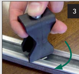
Turn 90°, the clip will keep its place, allowing adjustments. Secure the clip with a screwdriver.