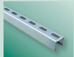
BIS RapidStrut® Rail