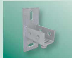
BIS Strut Wall Plate heavy (hdg)