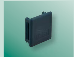
BIS Strut Rail End Cap