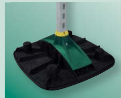
BIS Yeti Support System for Rooftop Installations