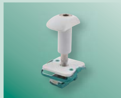
BIS RapidStrut® Solar Panel Fixing