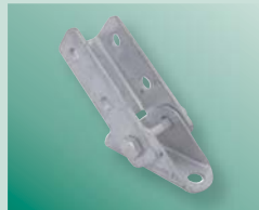
BIS Strut Wall Plate hinging (hdg)