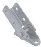
2. Part. No. 6658 1 814