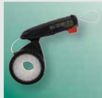
BIS STARLOCK® I

The BIS STARLOCK® II has a lever to tighten the strap even faster. It's the perfect tool for batch fixing of large quantities of cable strap.