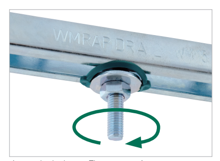
Insert, lock, done - The accessories are preassembled and delivered 'ready to use' to site. The plastic spring allows the slide nut to be fixed into the rail easily.