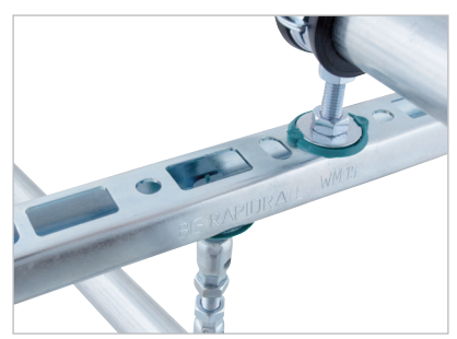
Easy fitting - RapidRail® WM15 has a unique hole pattern allowing the accessories to be used on both sides of the rail. The distance between the rail end and the first hole is always even.