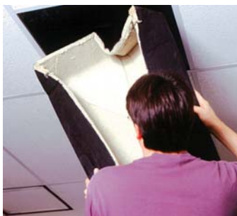
Simple and easy fitting by one man

The BIS Pacifyre® LC Luminar Cover completely covers the hole. In a fire situation, the cover expands internally to fill all the available space with a fire resistant highly insulating char. Fire and smoke are unable to penetrate the hole. The integrity of the ceiling is maintained thanks to the BIS Pacifyre® LC Luminar Cover.