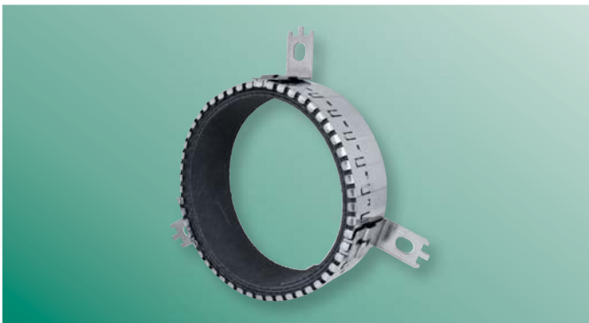
BIS Pacifyre® EFC Fire Collar Flexible built-up fire collar for fire safe and smoke tight sealing of pipe apertures.