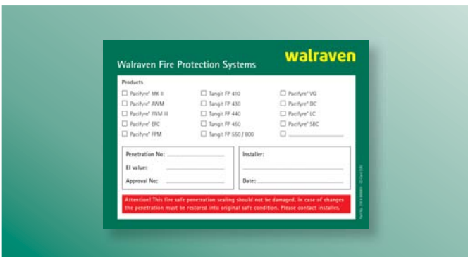
BIS Pacifyre® ID-Card For marking, identification and inspection purposes. For all BIS Pacifyre® Pipe Penetrations.