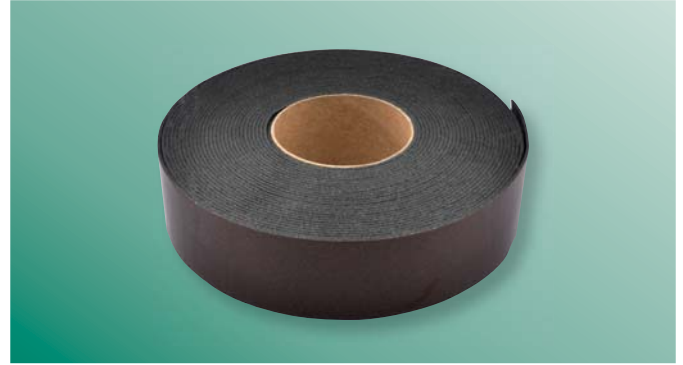
BIS Pacifyre® IWM III Fire Strip Fire strip for fire safe and smoke tight sealing of pipe apertures.