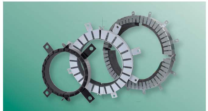
BIS Pacifyre® AWM Fire Collar Range Single built-up fire collar for fire safe and smoke tight sealing of pipe apertures.