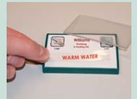
With transparent cover plate for do-it-yourself labelling