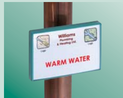
Fixing to pipe