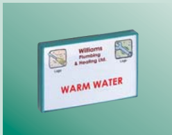
Fixing to walls