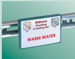
Fixing to rail