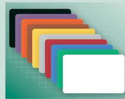
Available in 10 colours